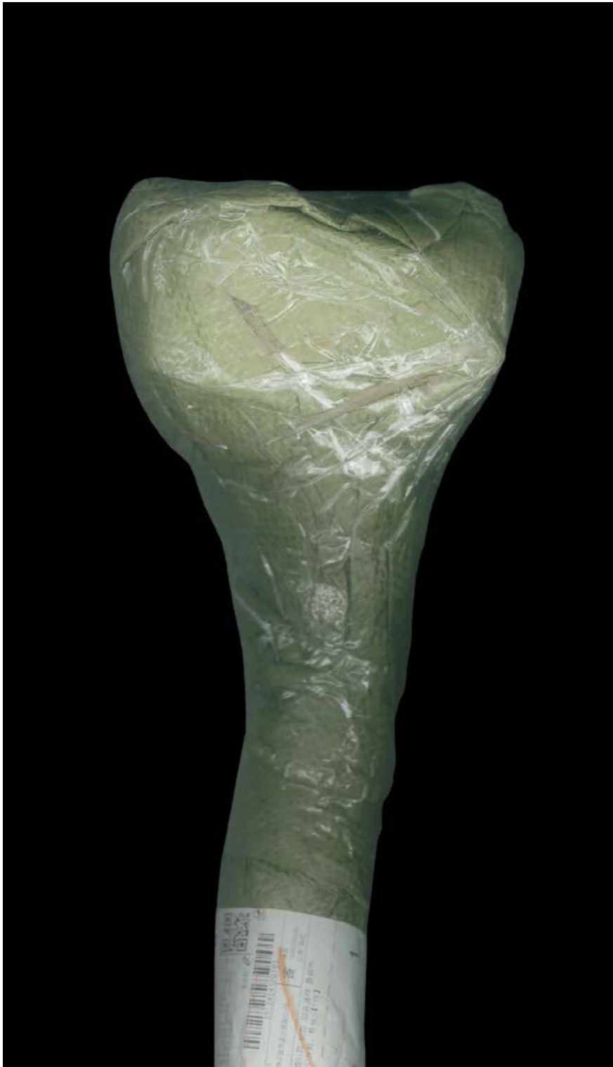
SCEPTER 2019 (VIDEO STILL)

SINGLE CHANNEL VIDEO, 1'25", EDITION OF 3