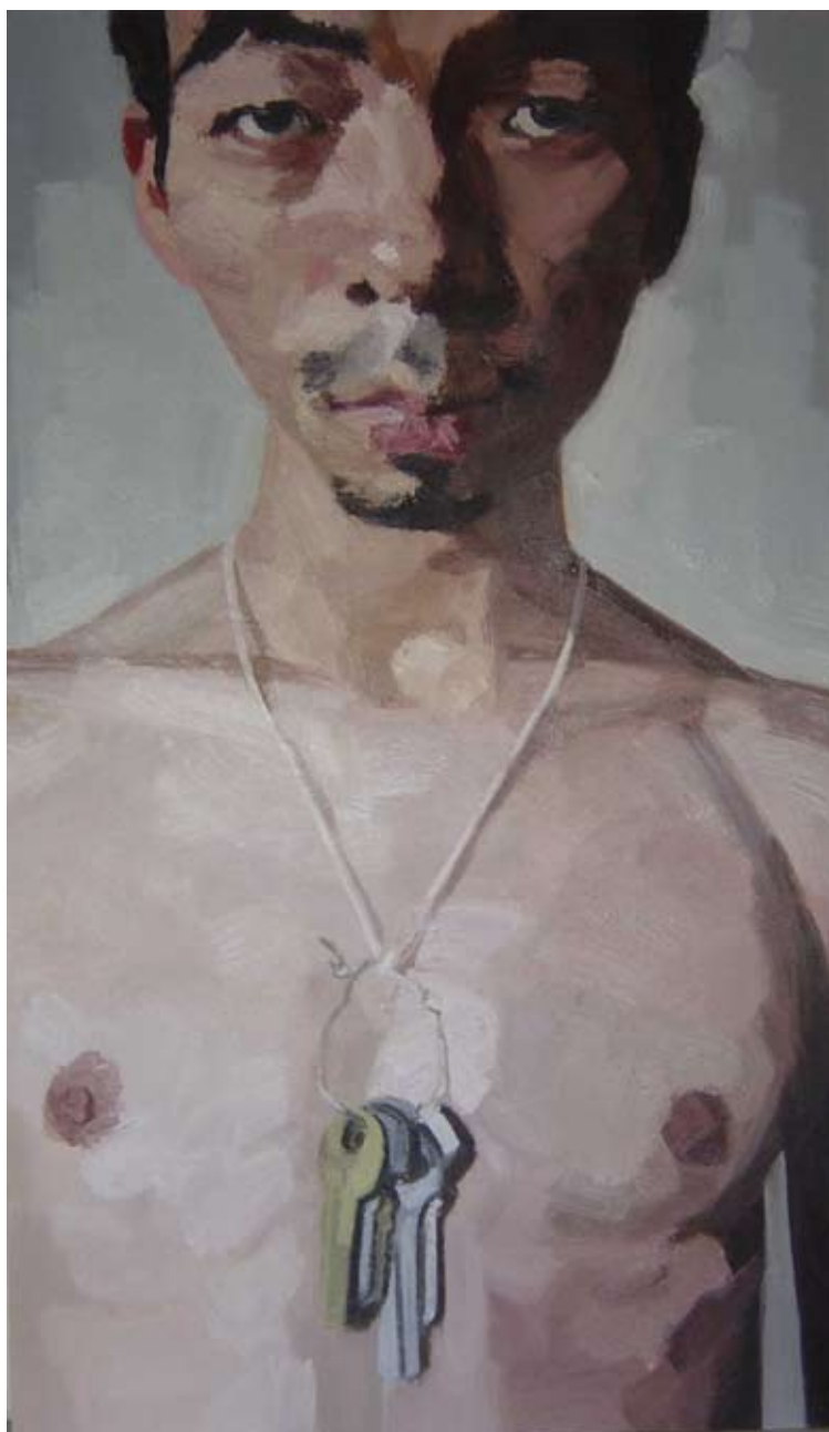
YOUTH WITH KEYS 1 2006 oil on canvas, 260x150cm, unique edition