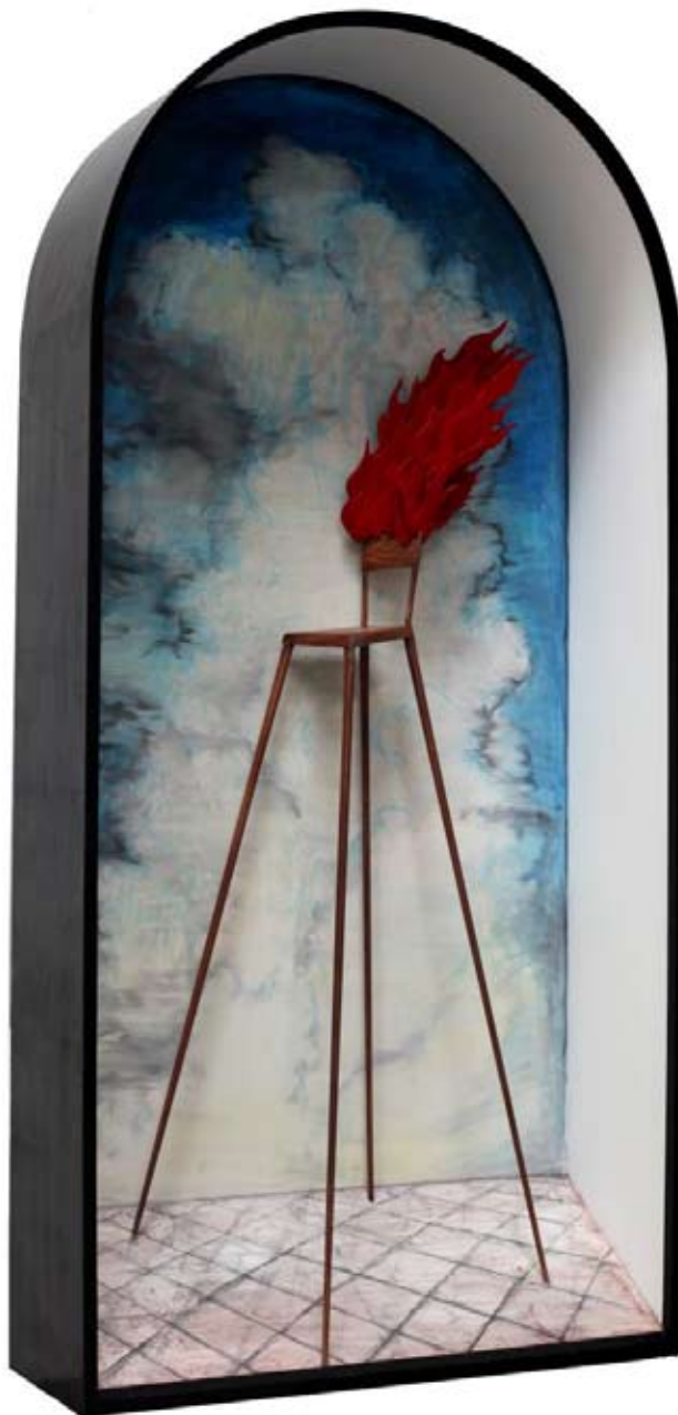
BURNING CHAIR 2010 installation en bois, 213x104x3cm, édition unique