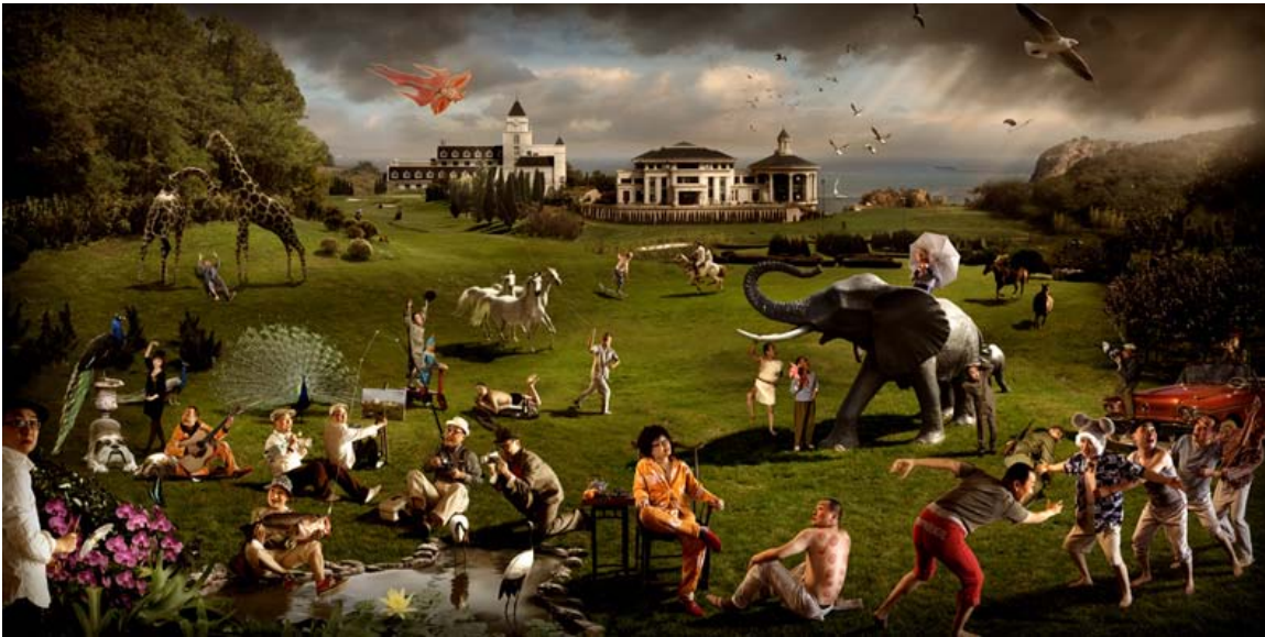
Perfect Life (2009) 180 x 90cm (edition of 5) • inkjet print