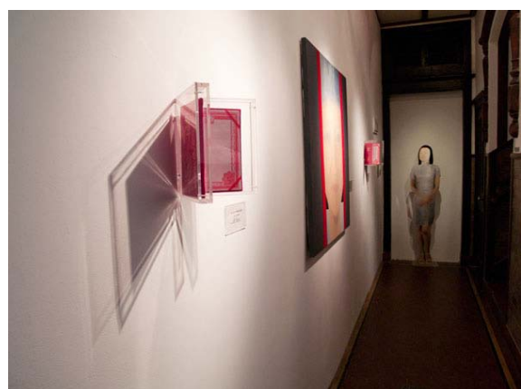
Purgatory (Zane Mellupe + Xu Yihan + Roland Darjes)