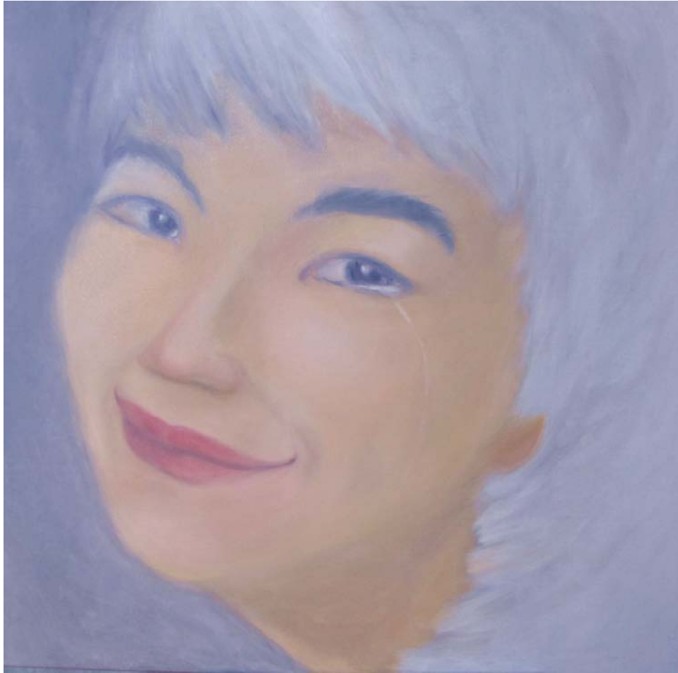
Giving up on Love (2011) 100 x 100 cm • oil on canvas