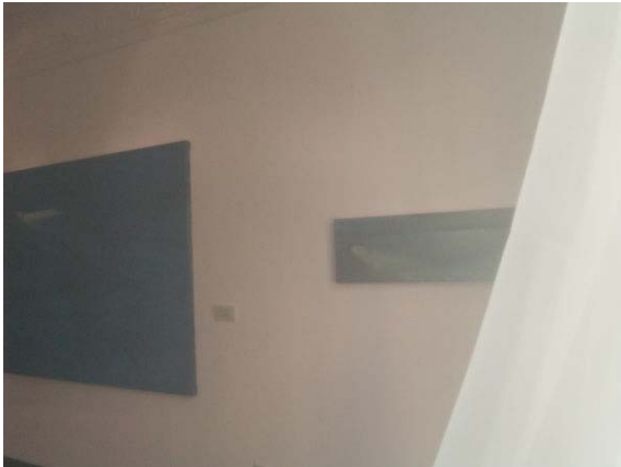
The Heaven (Zhu Ye)