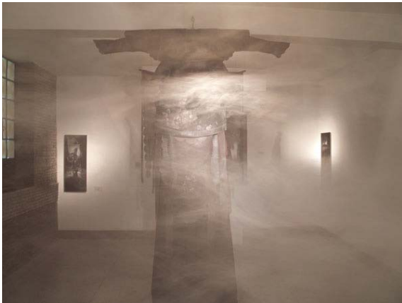
The Hell (Shao Shao)