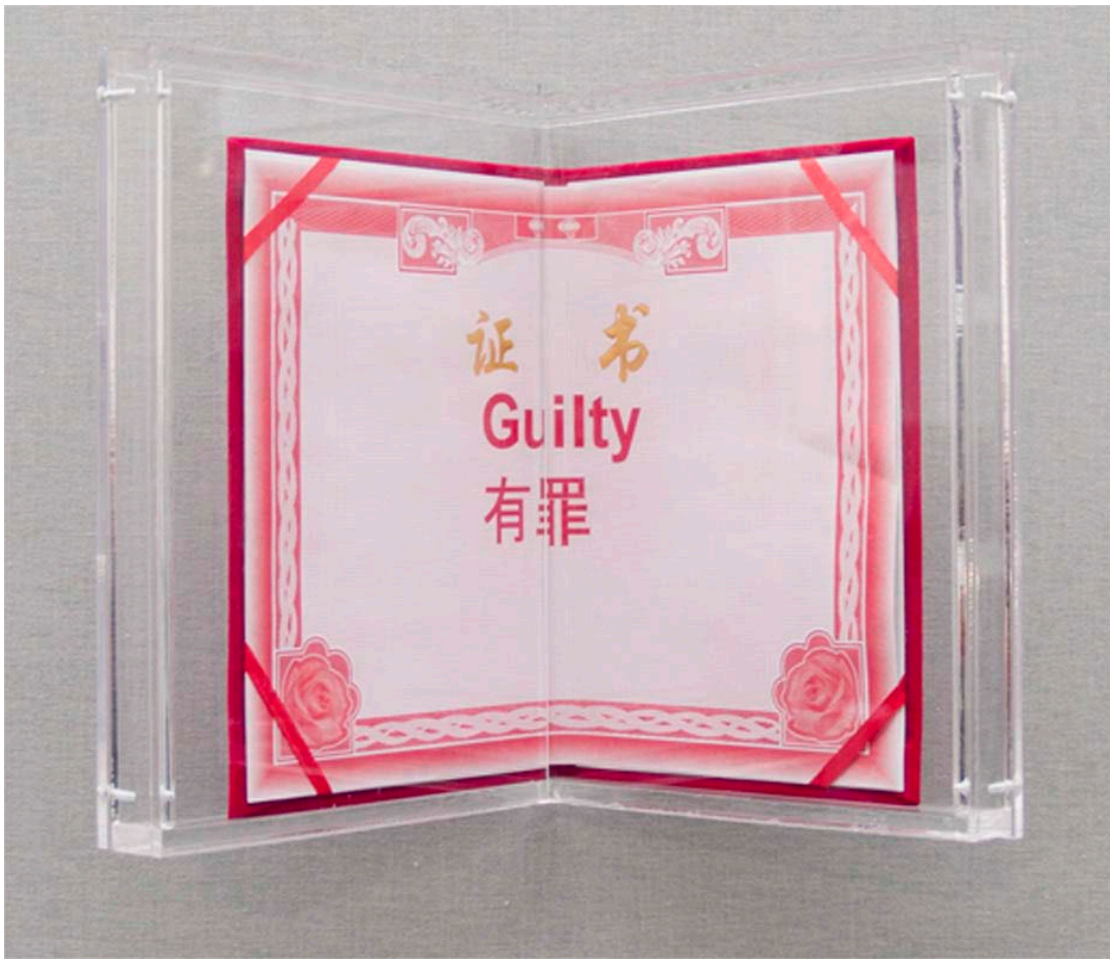
Certificate_Guilty (2011) 25 x 28.5 x 26cm • mixed media