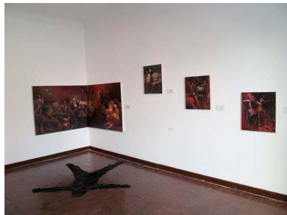
Sins (Chen Weide + Zane Mellupe)