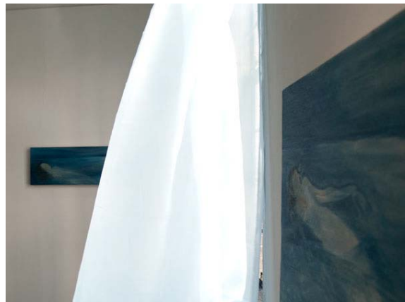
The Heaven (Zhu Ye)