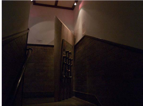
Doubt (Zane Mellupe)