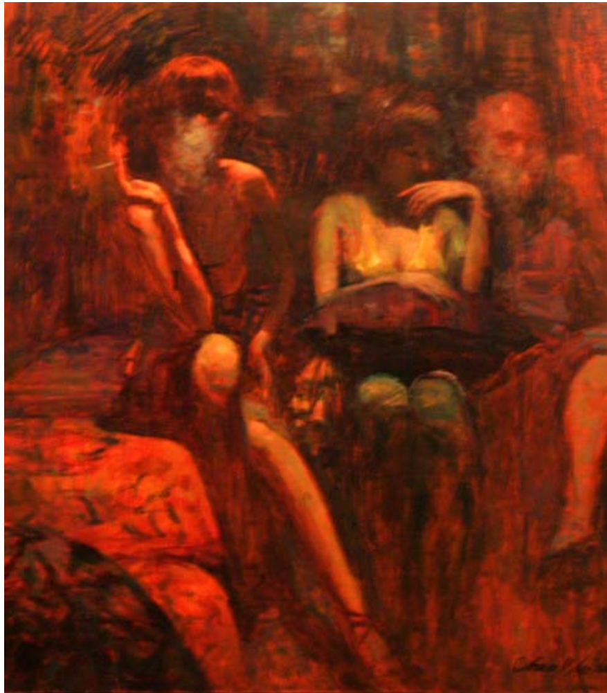
KTV1 54 x 46cm • oil on canvas