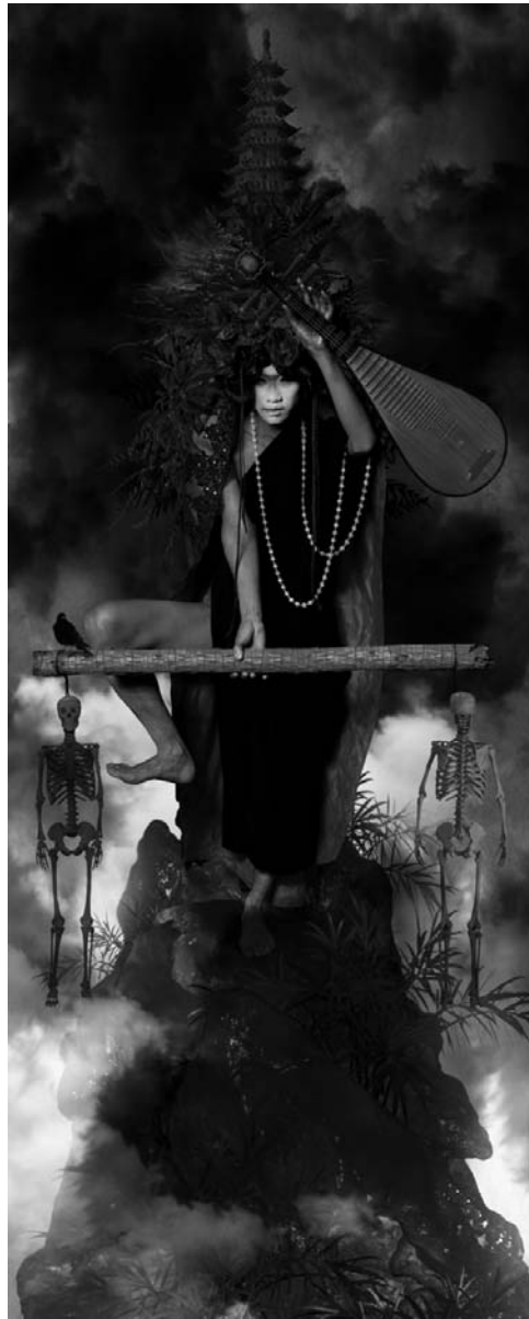
dhrtarastra (2008) 40 x 100cm • inkjet print