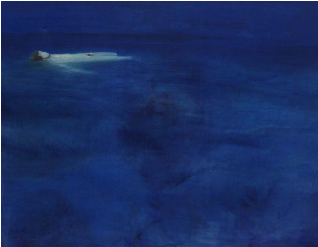
Floating No.6 (2011) 180 x 140cm • oil on canvas