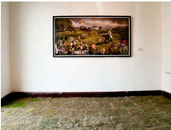
The World (Zhang Xianyong)