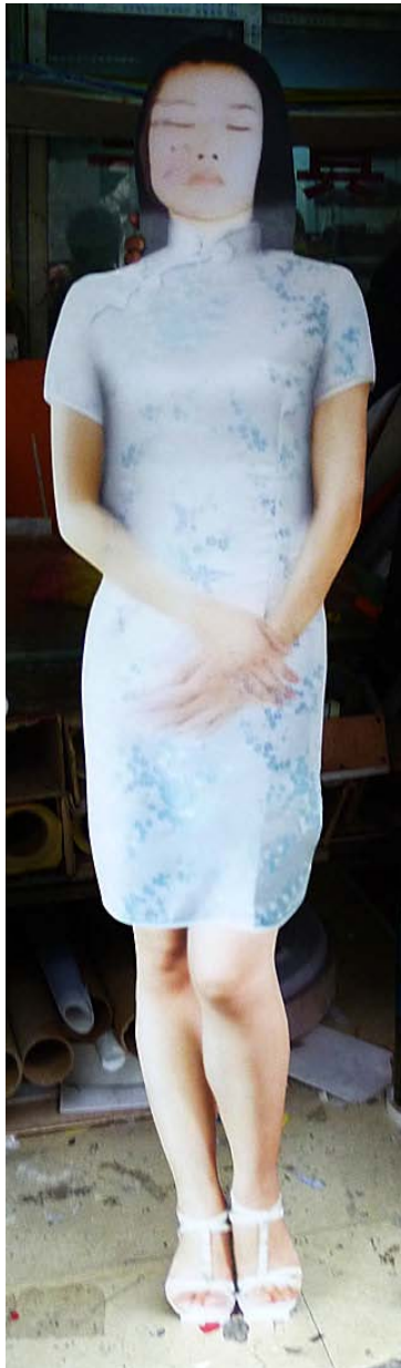
Judgmental Gesture (2011) 170 x 45cm • mixed media