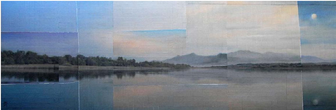
Memory of Wangshuan (2010) 74 x 214cm • ink and colour on xuan paper on canvas