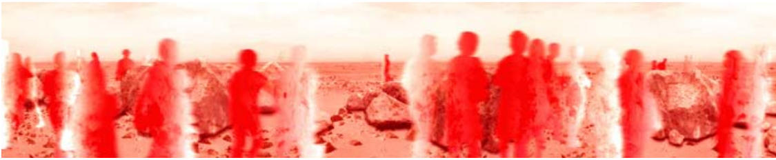
The Ten Commandments (2010) 60 x 12cm • inkjet print / lightbox