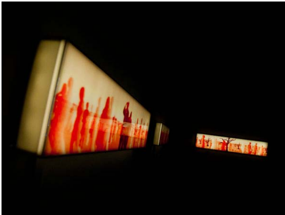
10 Commandments