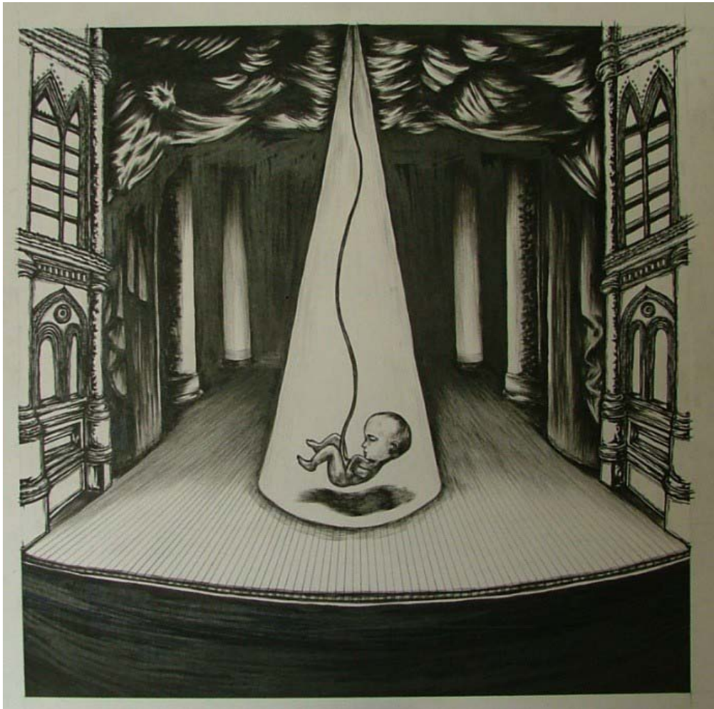
Tearful Comedy 2 (2011) 40 x 40cm • pen on paper