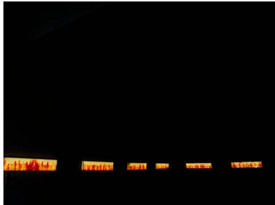
10 Commandments