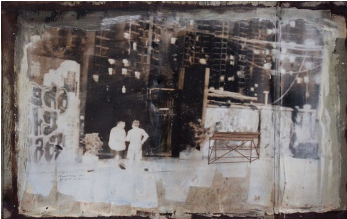
Forgotten Place 1 (2011)

100x157cm • photo emulsion on metal / wood