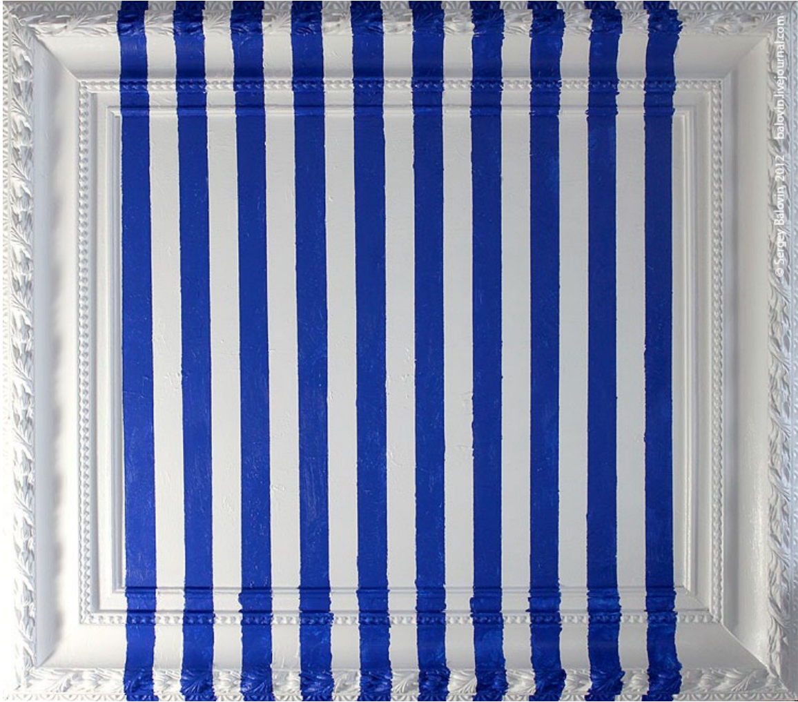
Dedicated to Daniel Buren (2010-2012)