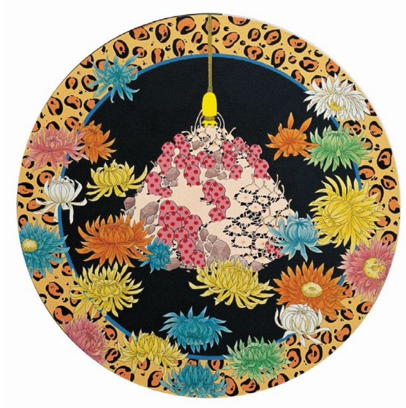
Qing Ming Festival (2012) Ø 60cm • oil painting on canvas