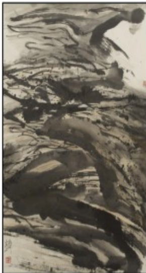
Dai Guangyu Mountains Beyond Mountains 2, 2014

(1983) seem to suspend time. Jinhwa Jung (1986) paint outside the traditional conventions and forms. Deconstructs the painted subjects led to bold new compositions.