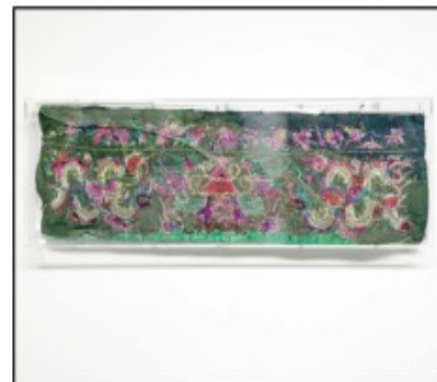
Zane Mellupe A ferry tale of a memory, 2015 Credits : ifa gallery

The painting of Li Chevalier (China, 1961) experimented China relationship ink on canvas, mixed with pigments, minerals, sand and Chinese art elements such as paper and rice calligraphy.