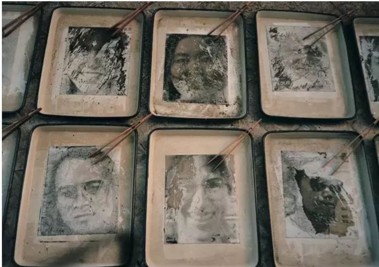
Long-abandoned Water Standards | Installation | 1995 | Chengdu