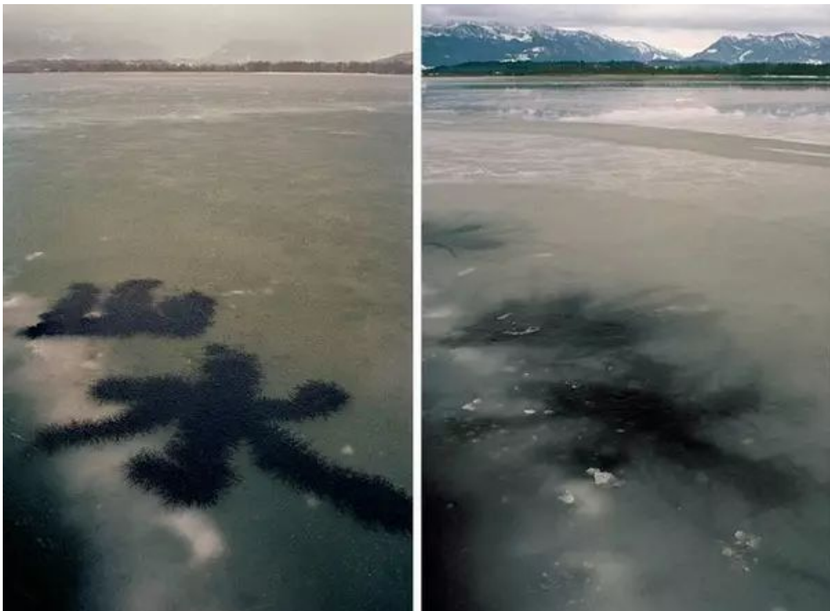
Landscape, Ink, Ice | Durational land art performance | 2004 | Germany

Ink functions as more than just a “sign” of culture, history, or art, but as a medium that materially mediates the performance. Dai Guangyu’s use of ink, therefore, is an organic extension (to contemporary performance art practice) of ink’s traditional role as visual medium for recording a calligraphic performance—essentially an index of the performance and the artist’s xintai or state of mind/being during the event. Just as a work of calligraphy creates a unique work of art—a unique visual record of a calligraphic performance—so too does Dai Guangyu’s performative use of ink and paper as both signifier and medium create a unique record of a live performance event. Making Traces shares this powerful aspect of his practice with the public for the first time.