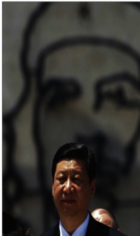
At the helm, but steering in which direction? Xi Jinping on a recent trip to Cuba

The irony, of course, is that it is China's economic miracle under the Communist Party that has enabled China's contemporary art