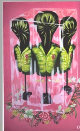
ON 25th JULY 2009 2009/0008

The exhibition was organized by Aperture, New York. National Building Museum 401 F Street NW Washington, DC 20001 USA www.nbm.org