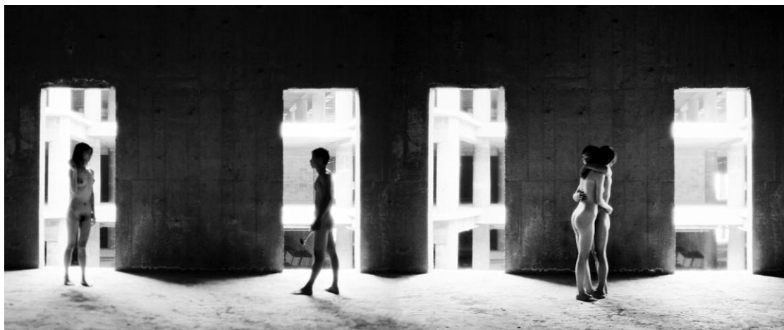
Gao Brothers, Confrontation and Embrace, (2001), c-print, 100x239cm, ed. of 5, ifa gallery

ifa gallery is happy to participate to Art15 London, the art fair specialized in contemporary art.