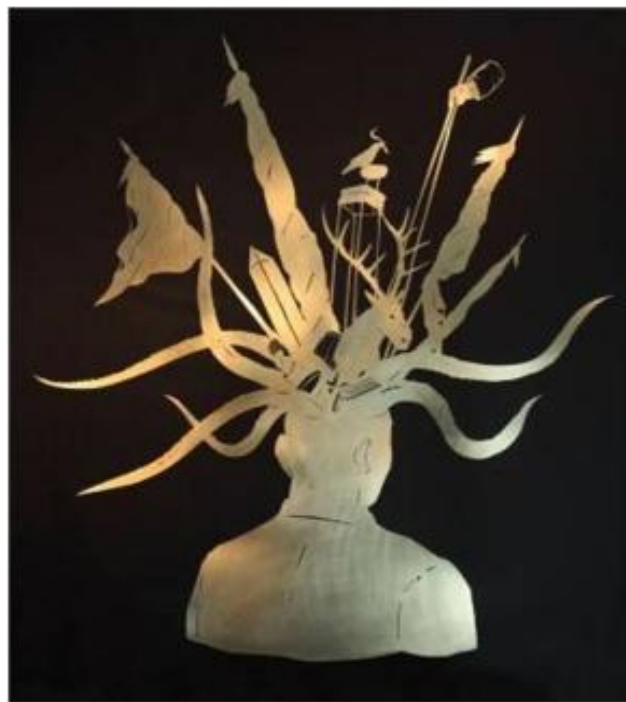
Wu Junyong, Portrait of a Totalitarian, (2010) brass sculpture, ed. of 6, 120x100cm