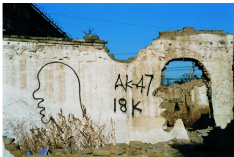
Zhang Dali, Demolition and Dialogue (1998)c-print, 60x90cm

Gao Qiang (born in 1962) and Gao Zhen (born in 1956) are the same two brothers whom work under the title "the Gao Brothers" since 1985. Globally recognized artists and often controversial, they explore public conscience incorporating references which many artists in China would not dare evoke. In the photograph, "Confrontation and Embrace", they employ compartmentalisation to place in question the taboo of physical public demonstrations and at the same time to magnify tenderness.