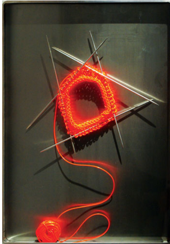
Zane Mellupe, Dowry Chest, Item No.4, the red sssock , 2011 light installation, knitting, stainless steel frame, 70x50cm