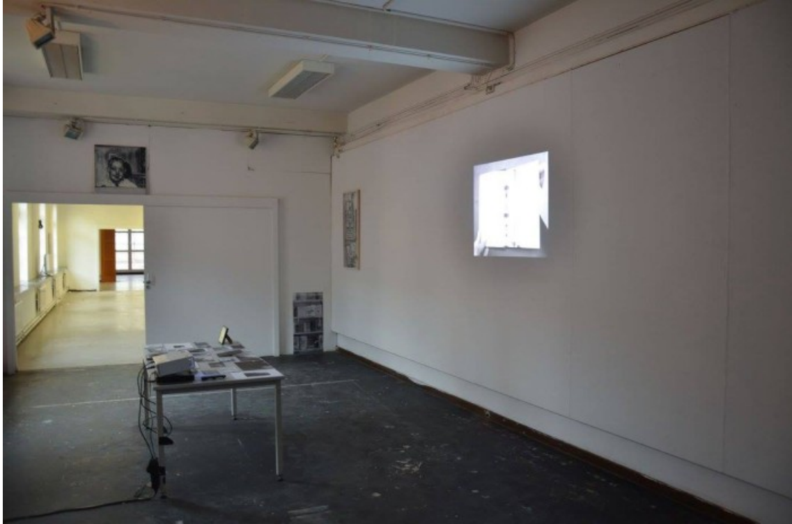
© Claire Ducène, Académie Royale des Beaux-Arts de la Ville de Bruxelles