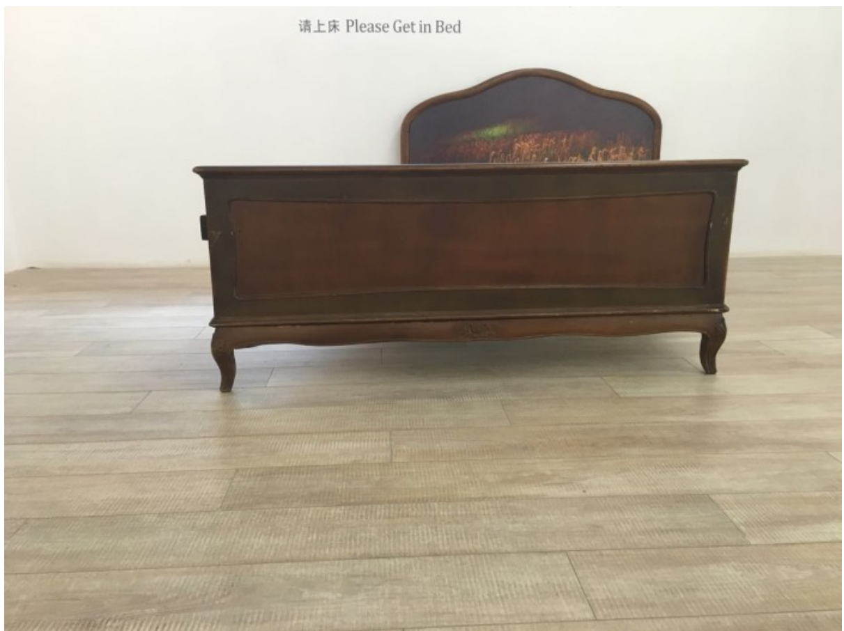
请上床 Please Get in Bed